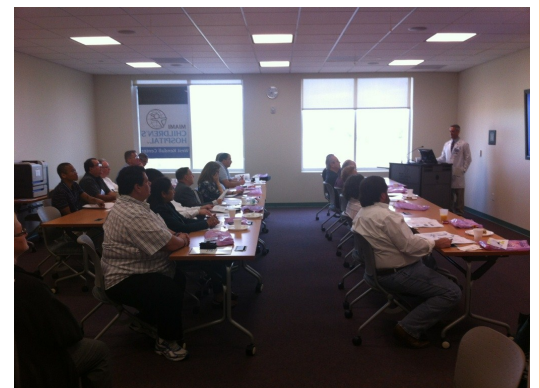
The Practical Community Pediatrics (PCP) CME was attended by 20 community pediatricians