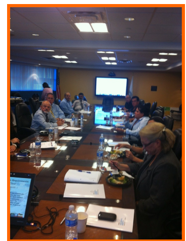
Community Preceptors Appreciation Dinner